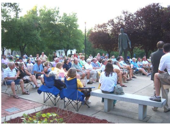
"Rockin' with Robert"