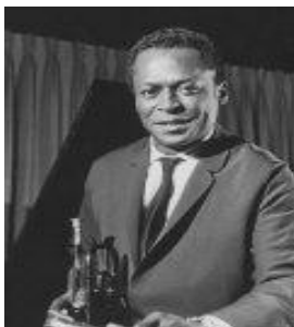
In Memory Miles Davis 1926 - 1991