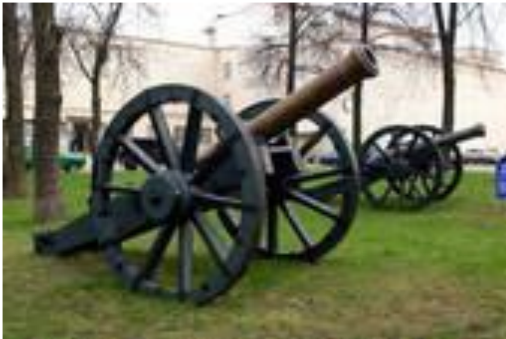
ARTILLERY OF 1812